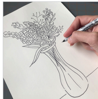
3) Now outline your pencil sketch using the fine Sharpie marker. Think basic shapes like a coloring book!