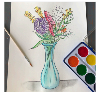
You can add a vase, or just illustrate the bundle of stems loosely. This is your masterpiece! No ones should look the same.