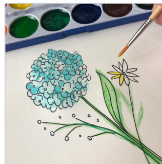
5) Now you're ready to add a splash of color. You can stay in the lines or add extra details outside the lines for a fun washy look.