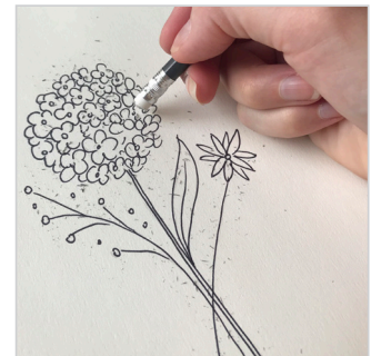
4) Let the ink dry a minute, then erase the pencil lines.